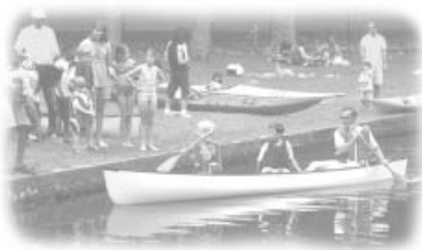
Friend's Day event