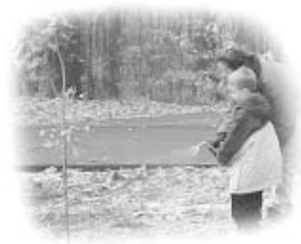
Arbor Day planting

“Dedicated to supporting, promoting, and protecting Paris Mountain State Park and its surroundings”